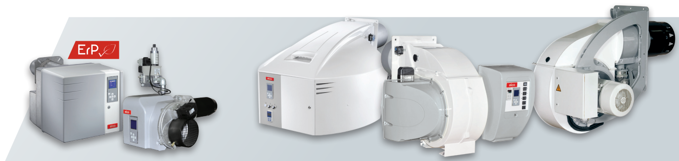
VECTRON 11 - 2300 kW

Our experience at combustion technology available in a complete range of burners from 11 kW to 80 MW: