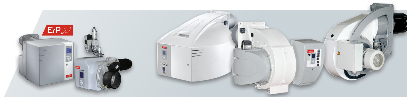
VECTRON 11 - 2300 kW

Our experience at combustion technology available in a complete range of burners from 11 kW to 80 MW: