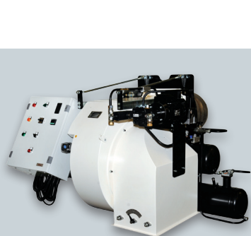
HO/GHO-TRON 68 - 17000 kW