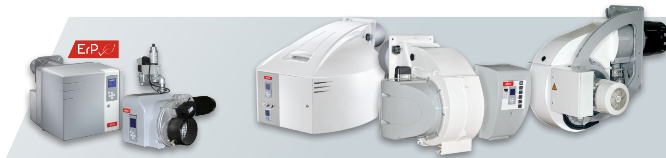
VECTRON 11 - 2300 kW

Our experience at combustion technology available in a complete range of burners from 11 kW to 80 MW: