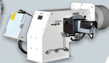
D-TRON 230 - 34000 kW