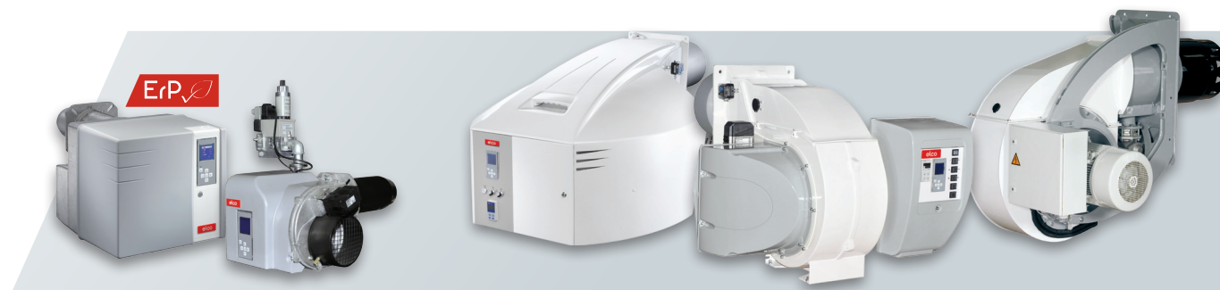
VECTRON 11 - 2300 kW

Our experience at combustion technology available in a complete range of burners from 11 kW to 80 MW: