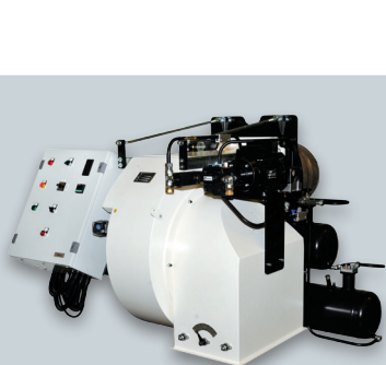
HO/GHO-TRON 68 - 17000 kW